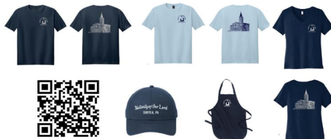
QR Code to order and size information